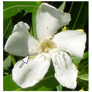
Brown spots on petals

Damage -Thrips adults and larvae feed by stabbing with their single mandible then sucking up the juices that ooze from the injury. Flowers or leaves may develop silvery scars that turn brown. Pale-colored flowers are particularly favored. Heavily infested leaves appear dusty or silver and dull, and growing points may become puckered or distorted. Sometimes, warty growth results. Some are predatory, feeding on other insects but particularly on mites. Some prepupal larvae do not feed. Thrips sometimes vector viruses; such as, tomato spotted wilt. They do NOT chew holes. ( Click images to enlarge or orange text for more information. )