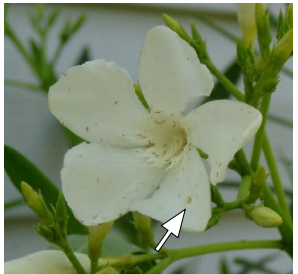
Brown dots are thrips