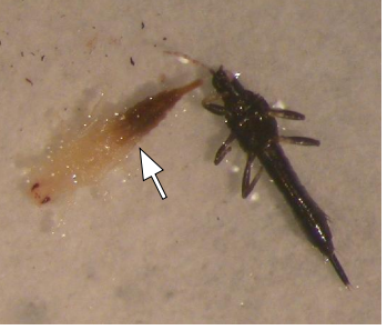
Pupa (left) halfway through color change