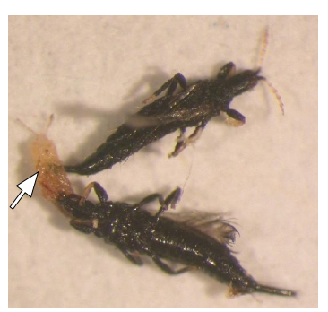
Adult (bottom) emerging from pupal case

Beneficial / Benign Aspects -Species in the Aeolothripidae are predators. They eat other insects or mites. Other species cause insignificant damage to plants or are benign.